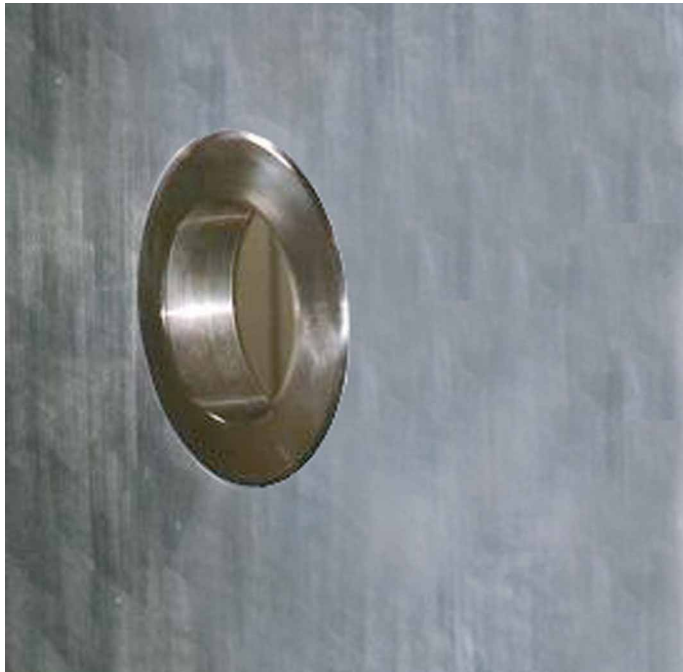
Figure 3: Adaptor seen from inside the tank

The sanitary model density transmitter is recommended for brewery installation and uses a tri-clamp connector for equipment mounting.