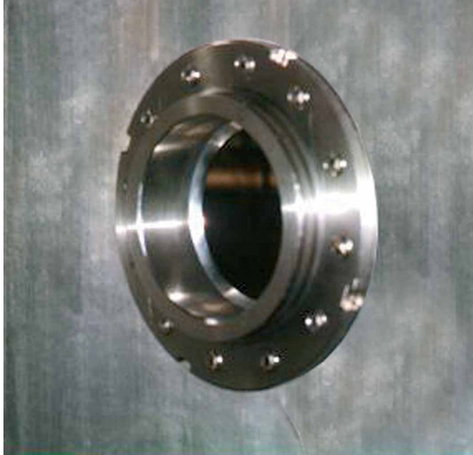
Figure 2: Adaptor seen from outside the tank

The following illustrates the tank adaptor for installation of the Density Transmitter: