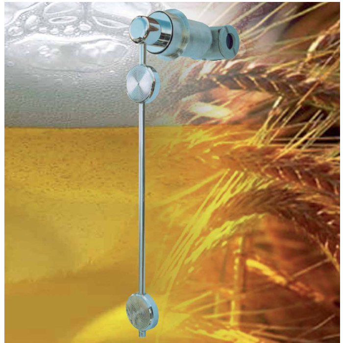
Figure 1: Density Transmitter - Sanitary Model DT302S

The unique design and assembly of the pressure and temperature sensors make it possible for small variations in the process to be