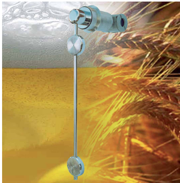
Figure 1: Density Transmitter - Sanitary Model DT302S

The unique design and assembly of the pressure and temperature sensors make it possible for small variations in the process to be