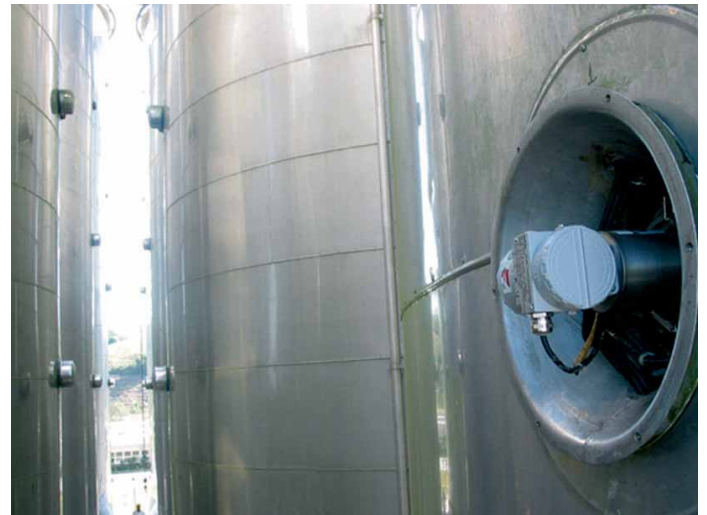
Figure 4: DT302S Installed on a Fermentation Tank

The DT302 is a two-wire loop powered device with Foundation Fieldbus communications protocol. It is also available with HART and Profibus communications. As a digital device, the instrument is capable of providing extensive amounts of process information, including Plato Degree and process temperature. As this information is available digitally, there are no errors in the transmission of the information.